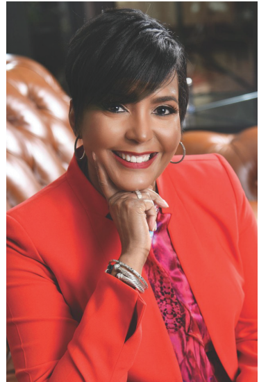
Keisha Lance Bottoms